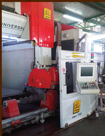
PEDRINI M 960 CNC 5 AXIS

Our associated principals include M/s. Solnhofen Stone Group (Germany), M/s. Marble Art (India), M/s. Stones Unlimited (India) and M/s. International Trade Links (India).