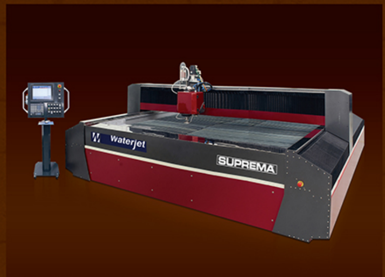
WATER JET SUPREMA _ITALY