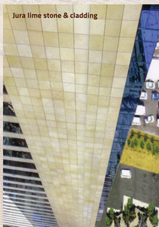
Jura lime stone & cladding