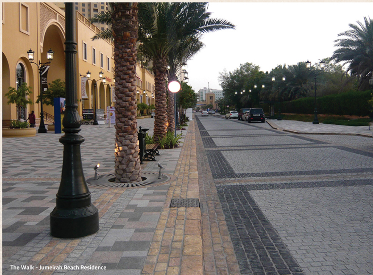
The Walk - Jumeirah Beach Residence