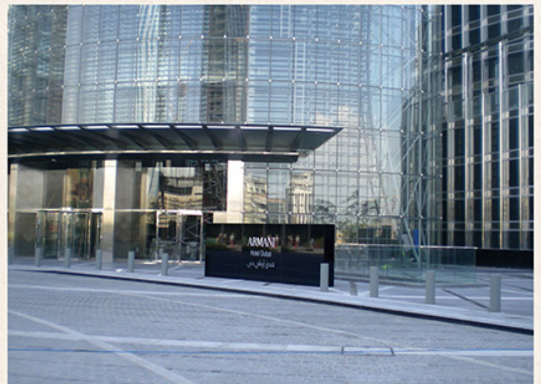
Armani Hotel Entrance